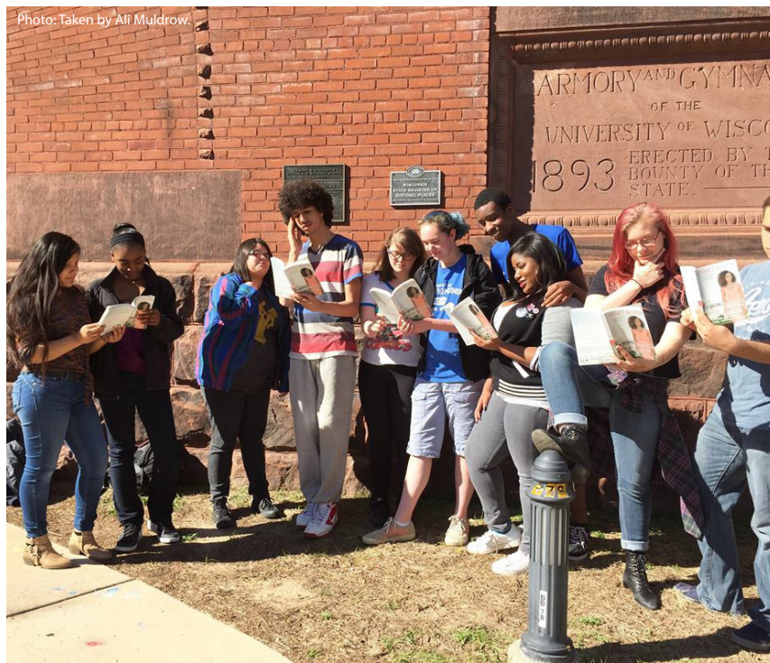
Foundations of Leadership Students