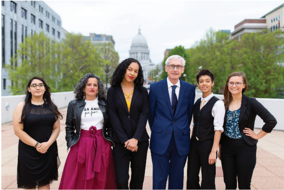
2018 GSAFE Scholarship and Awards Recipients