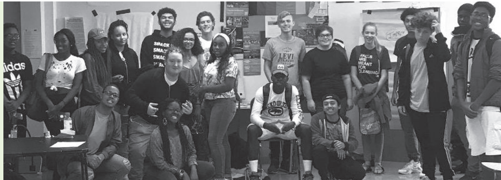
Clockwise from top left: Operation Fresh Start, Trick or Trot, Foundations of Leadership