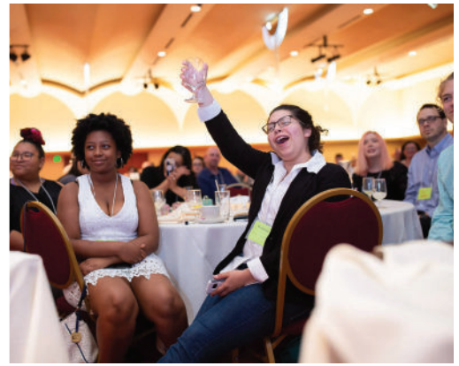
Celebration of Leadership