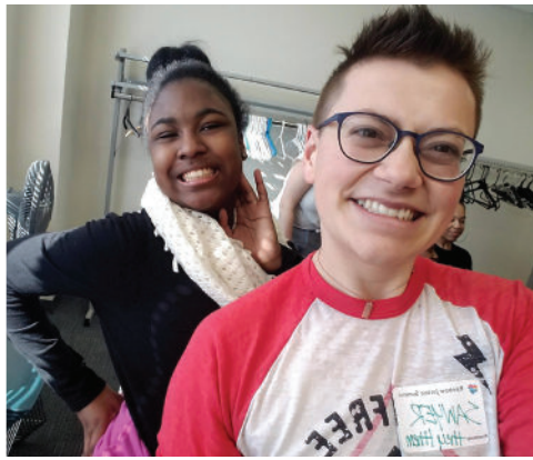
Trans Clothing Closet Project