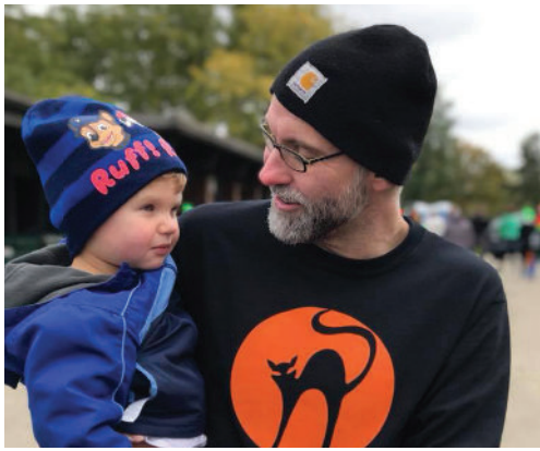
Trick or Trot