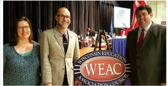
Top: March For Our Lives Rally Bottom: WEAC Friend of Education Award